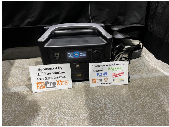
IEC Florida East Coast Chapter